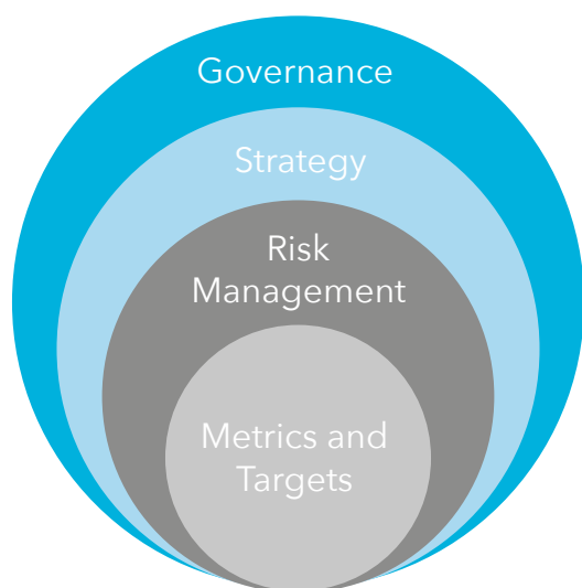
Figure 1. Core elements of TCFD framework

The TCFD framework and associated reporting covers four areas: